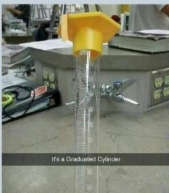
It's a Graduated Cylinder