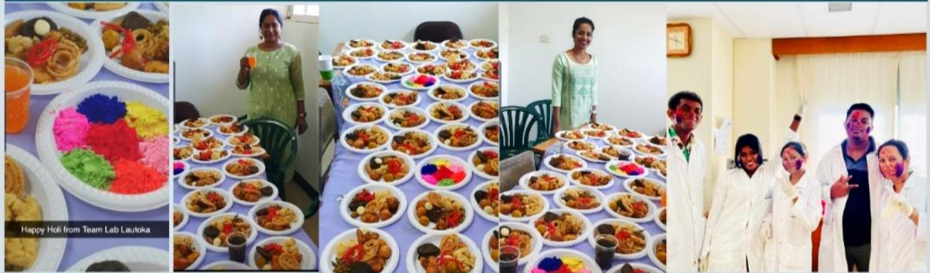
Happy Holi from Team Lab Lautoka

Holi, the festival of colors was celebrated by laboratory staff across Fiji. Many dressed up in colorful attires and enjoyed some sweets and savories on the day. Many also celebrated by playing with colors with fellow workmates. This day is celebrated to mark the beginning of the spring season as well as to celebrate the win of good over evil.